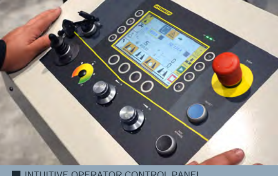
■ INTUITIVE OPERATOR CONTROL PANEL

The digital screen shows blade speed, miter angle, amperage draw, coolant level, machine condition, function mode, number of cuts and more, providing reassuring feedback to the operator.