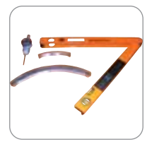
Radius & Degree Measuring Kit