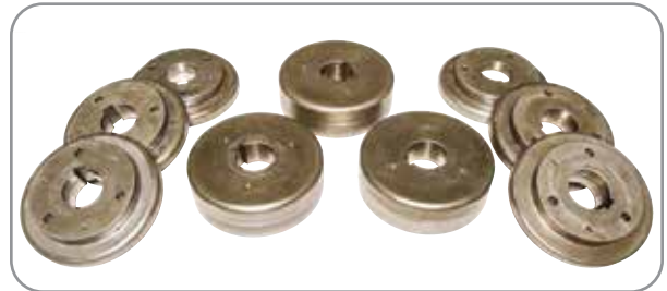
Universal Tooling Set Included for Multiple Profiles