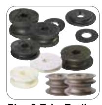
Pipe & Tube Tooling