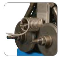
Small Radius Tooling