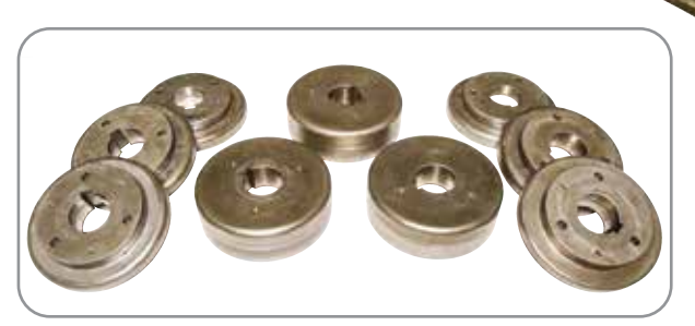
Universal Tooling Set Included for Multiple Profiles