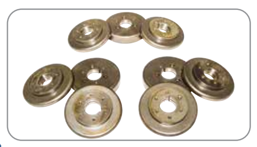
Universal Tooling Set Included for Multiple Profiles