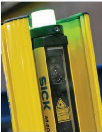
■ SAFETY LIGHT GUARDS