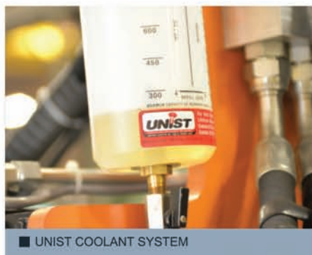
■ UNIST COOLANT SYSTEM

Since introducing the Ocean Avenger, hundreds of structural fabricators now enjoy the benefits of automated production: lower labor costs, increased capabilities and improved quality.