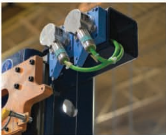
■ Y-AXIS AND CLAMP ENCODERS