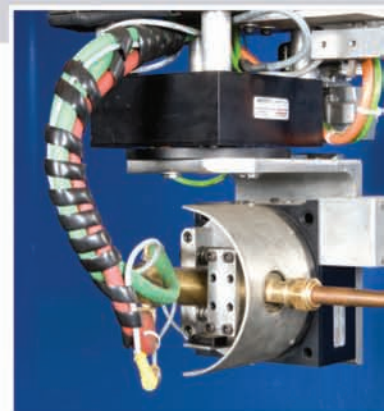
■ 5-AXIS ARTICULATING TORCH HEAD