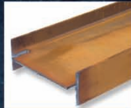
■ RAT TAILS / BEVELED FLANGES