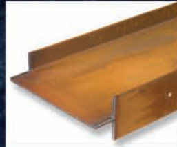
■ STRIPPED FLANGES