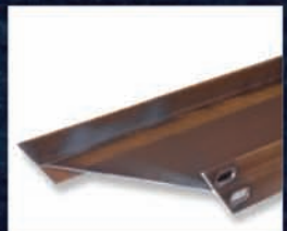
■ DOUBLE MITER CUT / SLOTS IN FLANGE