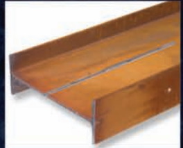
■ CUT TO LENGTH / BEAM SPLITTING