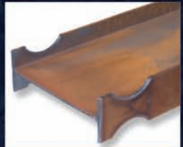
■ DOG BONES