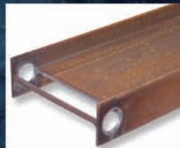
■ WEB / FLANGE PENETRATION