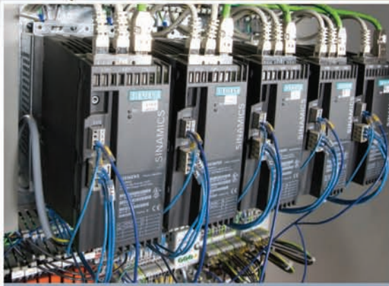
■ SIEMENS CNC SERVO MOTORS